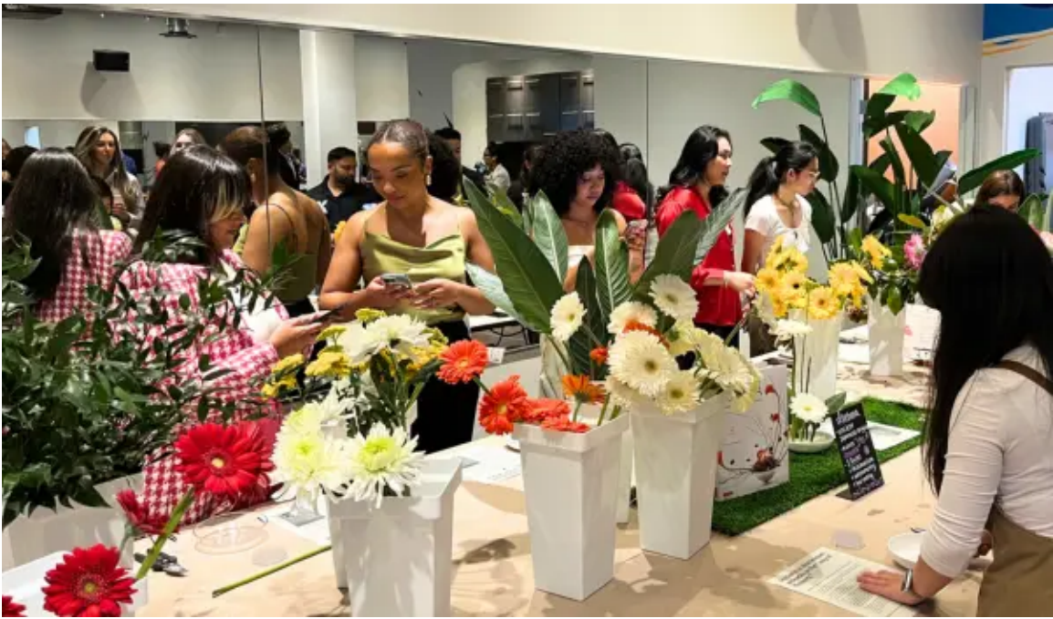
Attendees participating in the Ikebana workshop led by Posy Exchange.