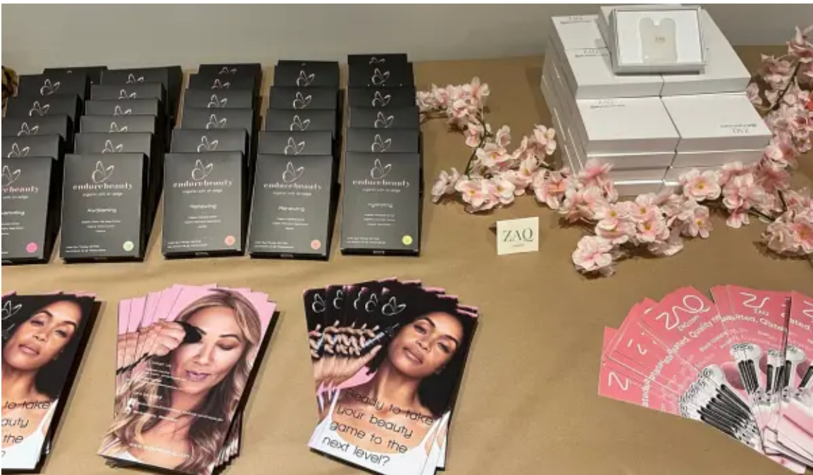
Gratis products provided by SalonCentric brands.