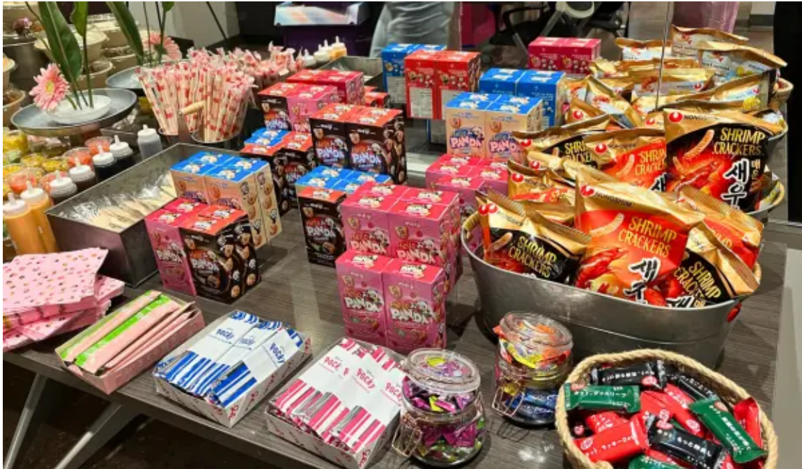
AANHPI snack bar and poke bowl station.